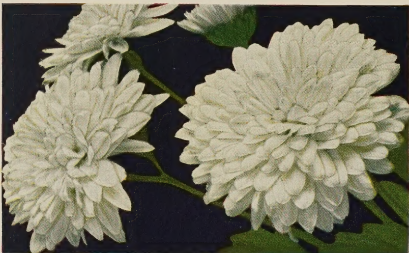
PAPER WHITE. 50c each; 3 for $1.25